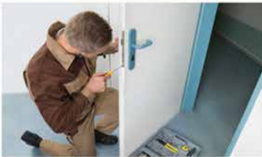
Mainteno is a complete, cost-effective solution for task facilities management.

Retail | Care Homes | Leisure Clubs Race Courses | Charities | Pub Chains | Office Management | Logistics