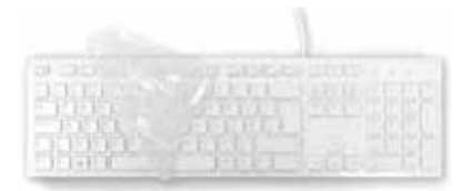
SteriType® Protective Keyboard Cover

HTM 01-05 compliant keyboards and mice, and recyclable phone sleeves are also