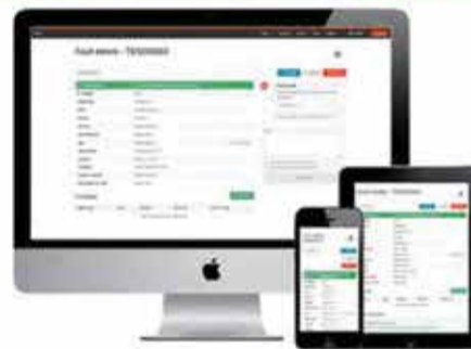
Usability made affordable

Mainteno streamlines every aspect of the maintenance management process, saving your organisation time and money.