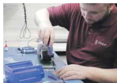
Steeper prosthetic technician manufacturing the Espire Elbow at Steeper's headquarters in Leeds in the UK

Manufactured by a skilled team of British technicians, the Espire™ Elbow is crafted entirely in-house in the bespoke assembly room for complete quality assurance. Each Espire Elbow is custom-made to order providing unique configuration options to patients, resulting in greater choice no matter the circumstances or condition of their needs. The Espire Elbow is a revolution in the world of prosthetics, boasting a flawless anatomical