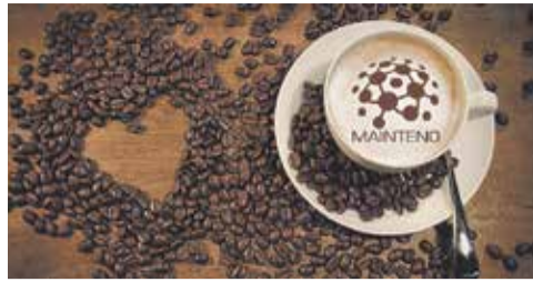
(Computer Aided Facilities Management) solution for organisations.

All accessed through one easy to use platform, Mainteno is a CMMS (Computerised Maintenance Management System) which provides a CAFM