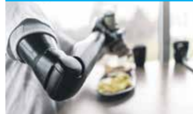
Revolutionary design mimics the natural movement of the human elbow; as testament to this, the Espire Pro was awarded the Red Dot Product Design Award in 2020

design that mimics the natural aesthetic of the human arm. As a result, and further testament to the design, the Espire Pro was awarded the prestigious Red Dot Design Award in 2020.